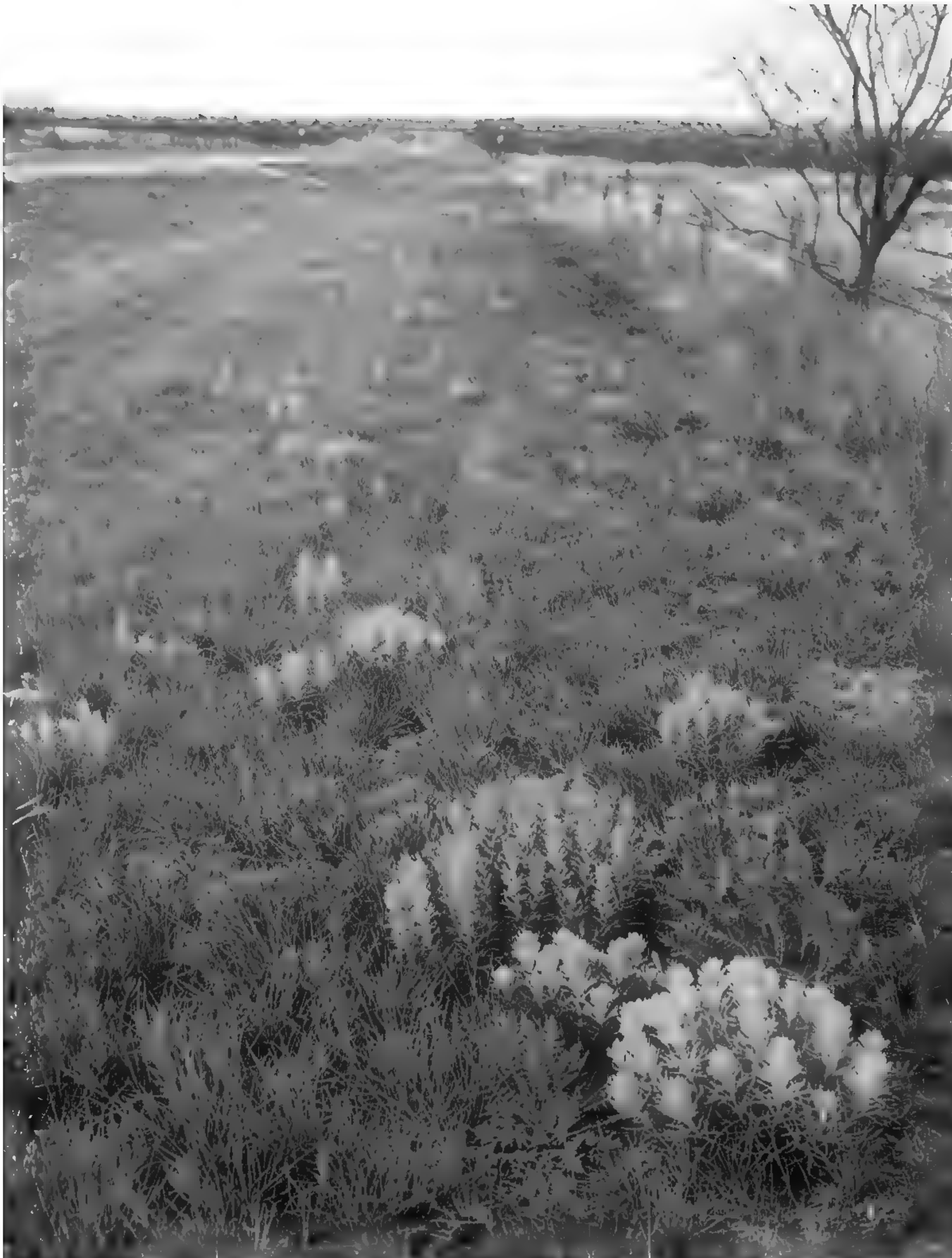
Figure 6 Castilleja citrina population in typical form East of Ballinger, Runnels Co., Texas, 6 Apr 1997